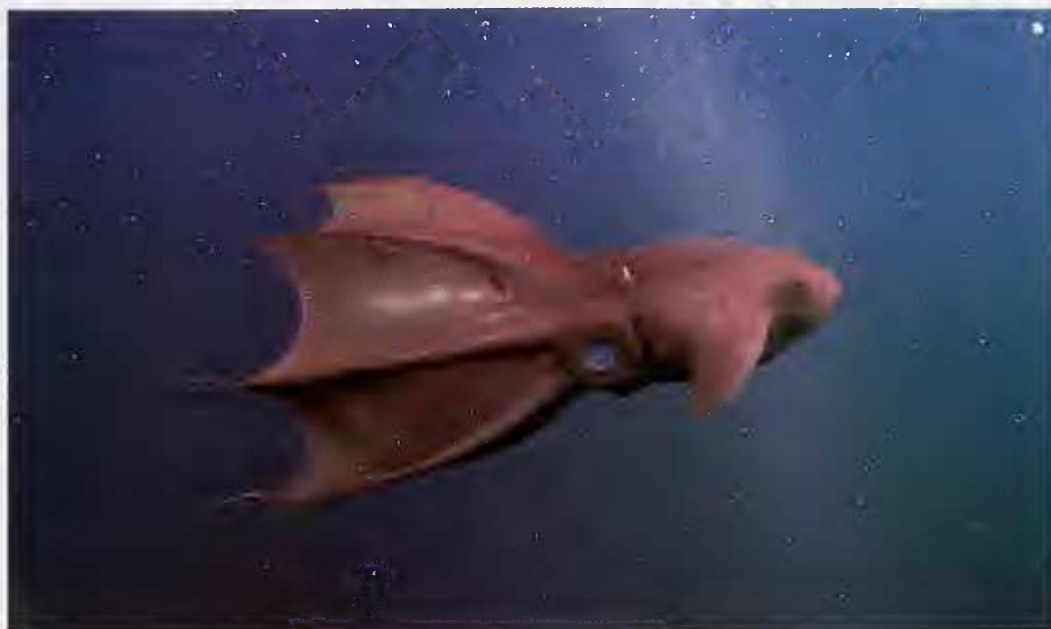
Figure 1. Vampyroteuthis infernalis , frame grab from high-definition video footage shot at a depth of 717 m in Monterey Bay, California. Mantle length = 10.2 cm. The fin-base photophore is located behind the dark patch of skin, posterior to (to the right of) the fin. The composite organ is the small, elongate white patch dorsal to and on a line just behind the eye. Minute epidermal organs are scattered over the surface of the mantle and the arms, but not on the web. The new arm-tip light organs described here are located on the oral surface of the filamentous portion of each arm, beyond the margin of the web.

where, depending on the species (Herring, 1977). The light they produce is used for attracting prey, deterring predators, and presumably for intraspecific communication. Luminous secretions are found in a number of deep-living invertebrates but are rare among cephalopods and fishes (Herring, 1977, 1988).